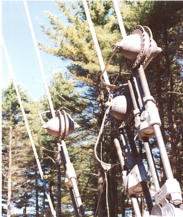
AR SANDAMPER unit lashed to guy cable