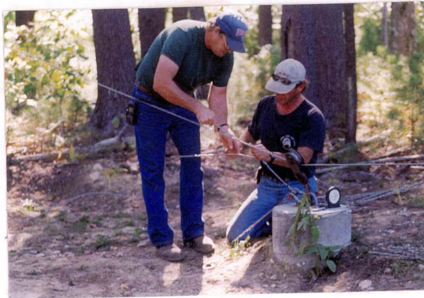
Inclinometer and Safe-Link Installation